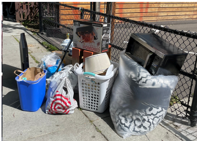
One of two carloads of donated items.

In Palo Alto, the spirit of community and compassion shines brightly. This year, Heart and Home Collaborative witnessed local residents and organizations support three participants transitioning from homelessness to permanent housing.