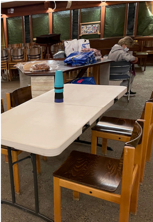
All set up for dinner!