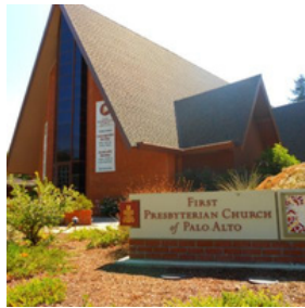
First Presbyterian Church of Palo Alto : host site since 2019.