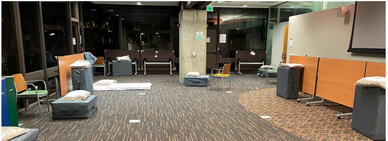
Mattresses set up for the Overnight Warming Location (OWL)

112 for 33 of whom 1 in 3 Bed-Nights Indoors Participants were in vulnerable health