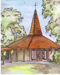
University Lutheran Church : supporters and host site since 2014.