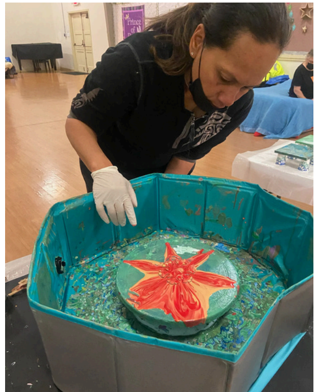
Our staff's creation from craft night

Our organization believes that shelter should be a space where participants feel valued. This past year, participants had the opportunity to attend a local Stanford tennis match, three craft nights onsite, and our Valentine's Day knitted hearts event. Activities like these help foster a deep sense of community among shelter participants, and ultimately help shelter feel a little more like home.