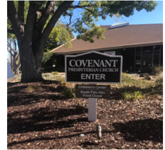
Covenant Presbyterian Church : host site since 2021.