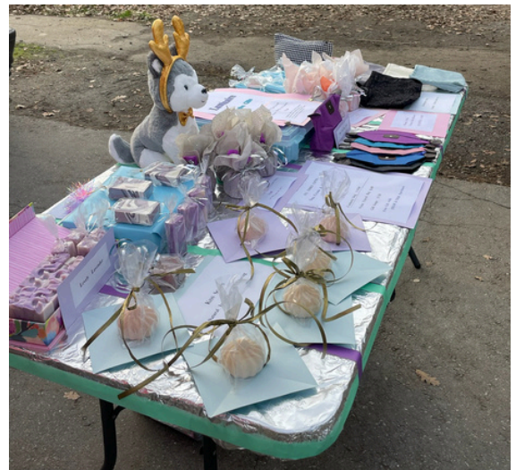
A participant used the fund to bootstrap a small soap business!