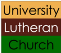
University Lutheran Church : supporters and host site since 2014.