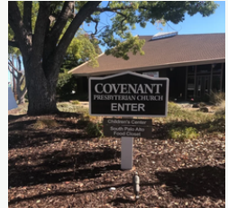
Covenant Presbyterian Church : host site since 2021.