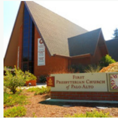
First Presbyterian Church of Palo Alto : host site since 2019.